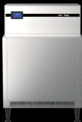
BUZ - 330

Our most popular Bullet Ice made with Patented Centrifugal Technology, ideal for upscale hotels, bars, restaurants, and packaged ice needs. This ice shape not only adds a touch of sophistication but also rapidly cools your beverages for an unparalleled drinking experience until the last sip.