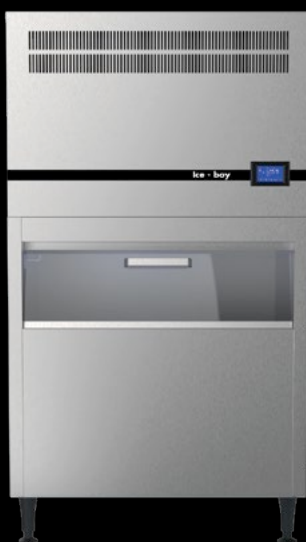
BUZ - 550 BUZ - 900