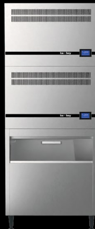
BUZ - 1800